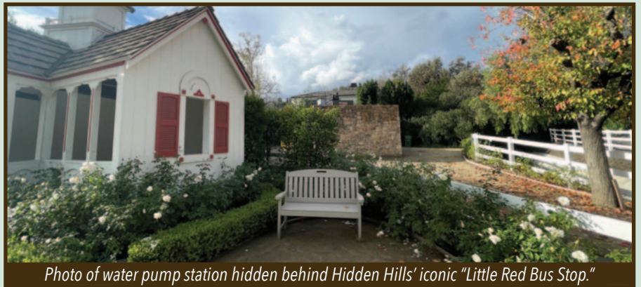
Photo of water pump station hidden behind Hidden Hills' iconic "Little Red Bus Stop."

The Las Virgenes Municipal Water District completed the new water pump station located next to the Little Bus Stop at the Round Meadow Road/Jed Smith Road Intersection. The new generator and sound wall will ensure that power is maintained to the pump that provides water to City residents and fire hydrants in cases of emergencies or unexpected power outages.