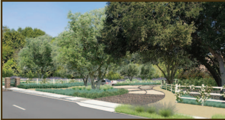
Rendering of the Long Valley Gate parking lot of how it will look once completed.

2023 was full steam ahead on numerous improvement projects that have been completed or are currently underway, further enhancing the overall quality of life for Hidden Hills residents.